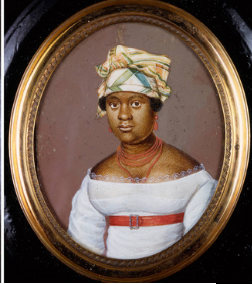
Watercolor portraits of Pierre Toussaint and his wife, Juliette Noel Toussaint.