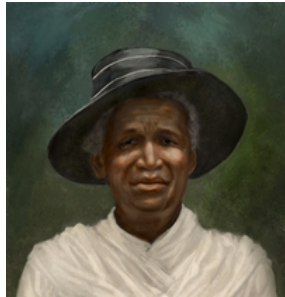
11 SERVANT OF GOD JULIA GREELEY