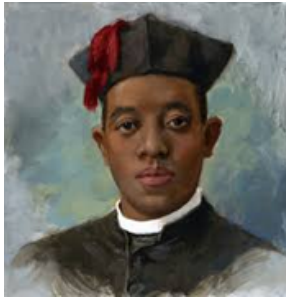
09 VENERABLE FR. AUGUSTUS TOLTON