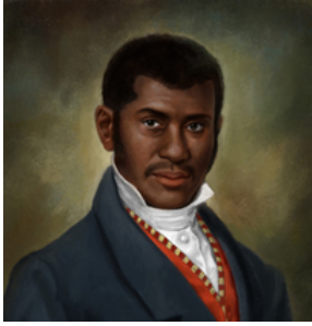
03 VENERABLE PIERRE TOUSSAINT