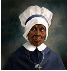
05 SERVANT OF GOD MOTHER MARY LANGE