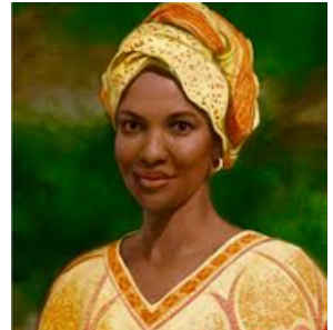
13 SERVANT OF GOD SR. THEA BOWMAN

Text is from the United States Conference of Catholic Bishops Prayers approved for individual use Images found online