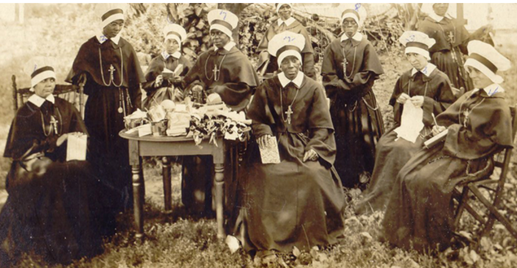
Photo of early Oblate Sisters of Providence.

Servant of God Mother Mary Lange was born Elizabeth Lange, a native of the Caribbean, and believed to be Cuban born of Haitian descent. She was the foundress and first Superior General of the Oblate Sisters of Providence (1829-1832), the first religious congregation of African American women in the history of the Catholic Church. On July 2, 1829, Elizabeth and three other women professed their vows and became the Oblate Sisters of Providence with the goal of educating and evangelizing African Americans. They educated youth and provided a home for orphans. Freed slaves were educated and at times admitted into the congregation. They nursed the terminally ill during the cholera epidemic of 1832, sheltered the elderly, and served as domestics at St. Mary's Seminary. Mother Mary Lange practiced faith to an extraordinary degree. It was her deep faith – in close union with Jesus – which enabled her to persevere against all odds. She lived through disappointment and opposition until God called her home in 1882 at the St. Frances Convent in Baltimore, Maryland.